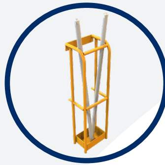
Strip Light Bulb Holder

Keep tools safe and secure whilst working at height